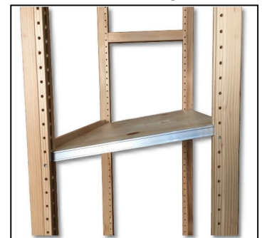
Set pin in back 2" higher than pin in front. Shoe shelf cannot be angled any more than this.

Questions? Call us Toll Free in US: (888) 989-1370 Monday - Friday, 8:30 - 5:00 Pacific Standard Time