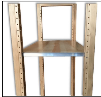
Height is adjustable on 1" increments.