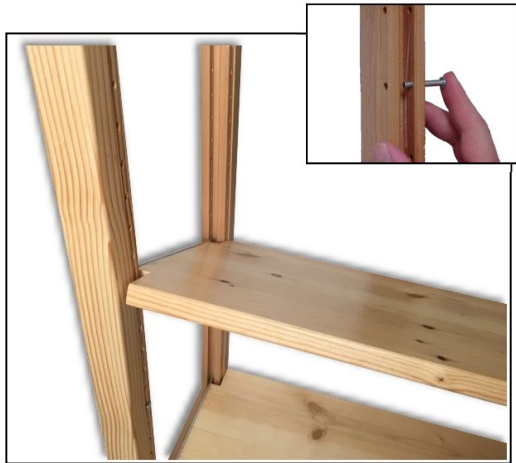
Insert 4 Steel Pins in Upright Holes to support shelf. Slide shelf into upright.