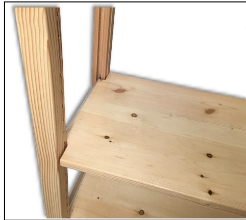
The metal bar on the end of each side of the shelf will rest flat on steel pins.