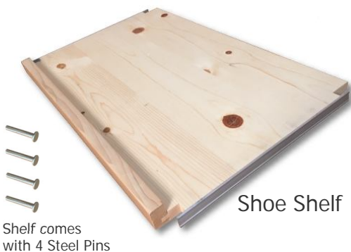
Shelf comes with 4 Steel Pins