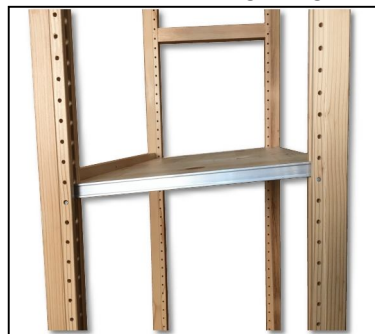
Set pin in back 1" higher than pin in front