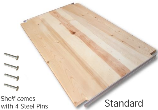
Shelf comes with 4 Steel Pins